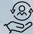
Equity and Inclusion